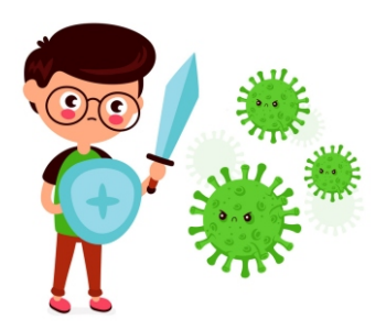
USE HAND SANITIZER